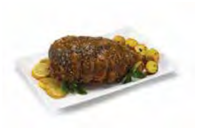
Leg of Lamb Roast

Traditional and exceptional, a fresh leg roast makes a spectacular centerpiece for any table. Don't forget the mint jelly.