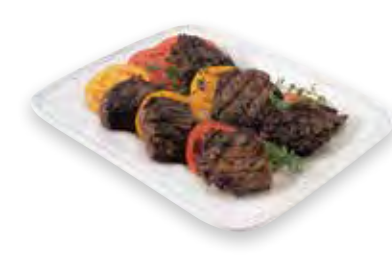
Marinated Beef Tips

Tender choice beef tips, featuring any one of our amazing marinades.