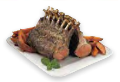
Rack of Lamb Roast

Our classic, all-natural 7-bone rack of lamb. 1.5-2.5 lb. average, 1 serving per cooked lb.